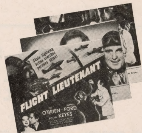
EIGHT 11 x 14's